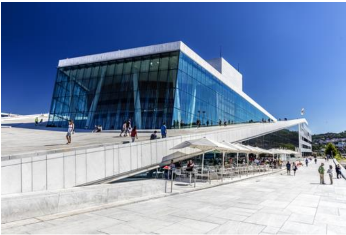
The roof of the Opera

1930: Dinner at Brasserie Sanguine, Kirsten Flagstads pl. 1, 0150 Oslo